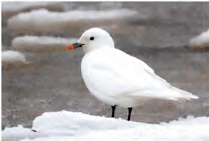
Ivory Gull, Piermont Pier, Rockland Co., 26 Feb 2007.

Figure A (top) copyright Sean Sime; Figure B (bottom) copyright Lloyd Spitalnik.